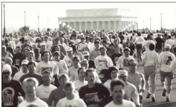
1993 saw the first use of Memorial Bridge on the Cherry Blossom course.