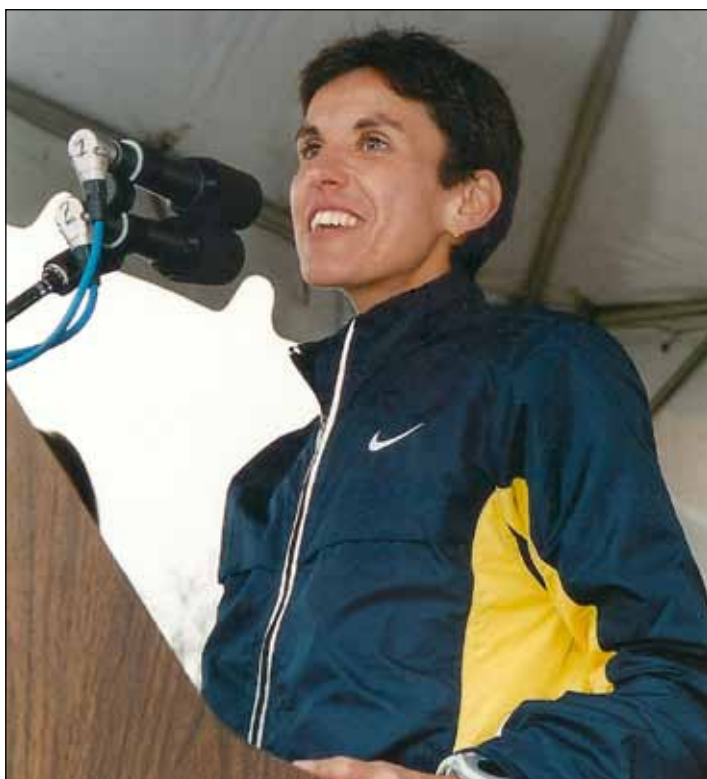
2001 Women’s Champion Elana Meyer